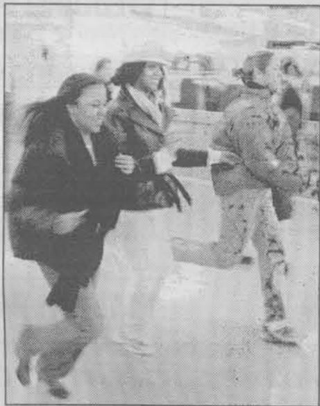
RUSH HOUR: Eager wedding dress seekers sprint through Filene's Basement as soon as the doors open yesterday.